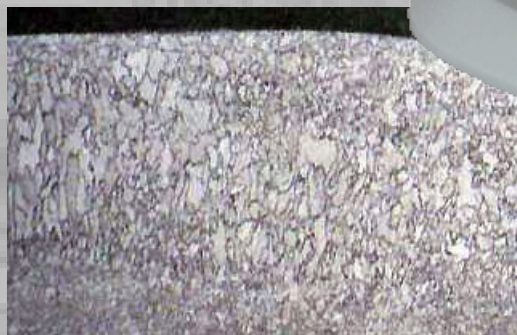
Stereo microscope image of filler metal in a steel weld