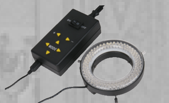
LED Illuminator ML-144D